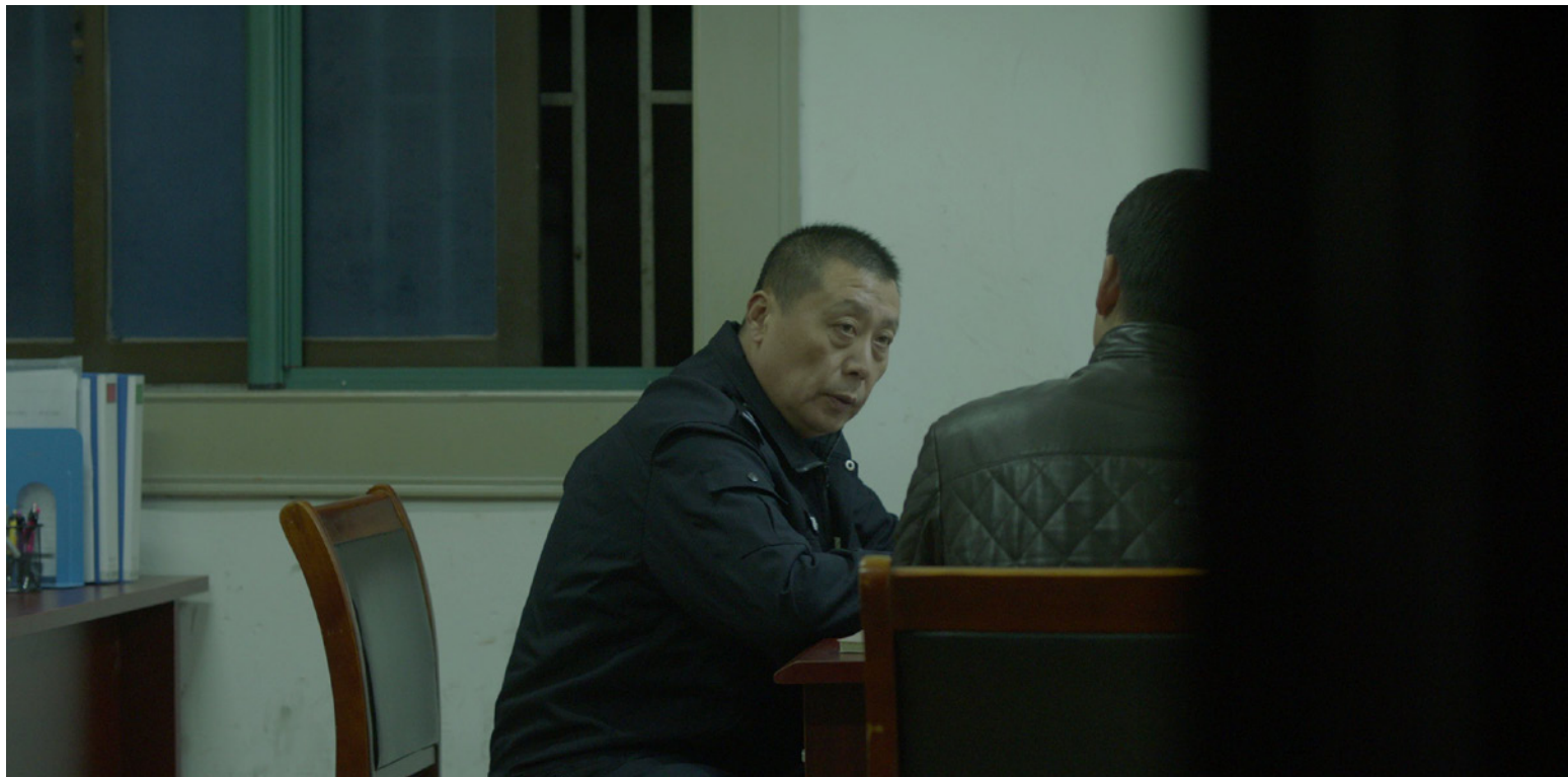
A Gentle Night

This GFF edition's Short Films Competition is comprised of a lineup of films with social themes, tackling concepts of loneliness, motherhood, disability, senility and childhood.